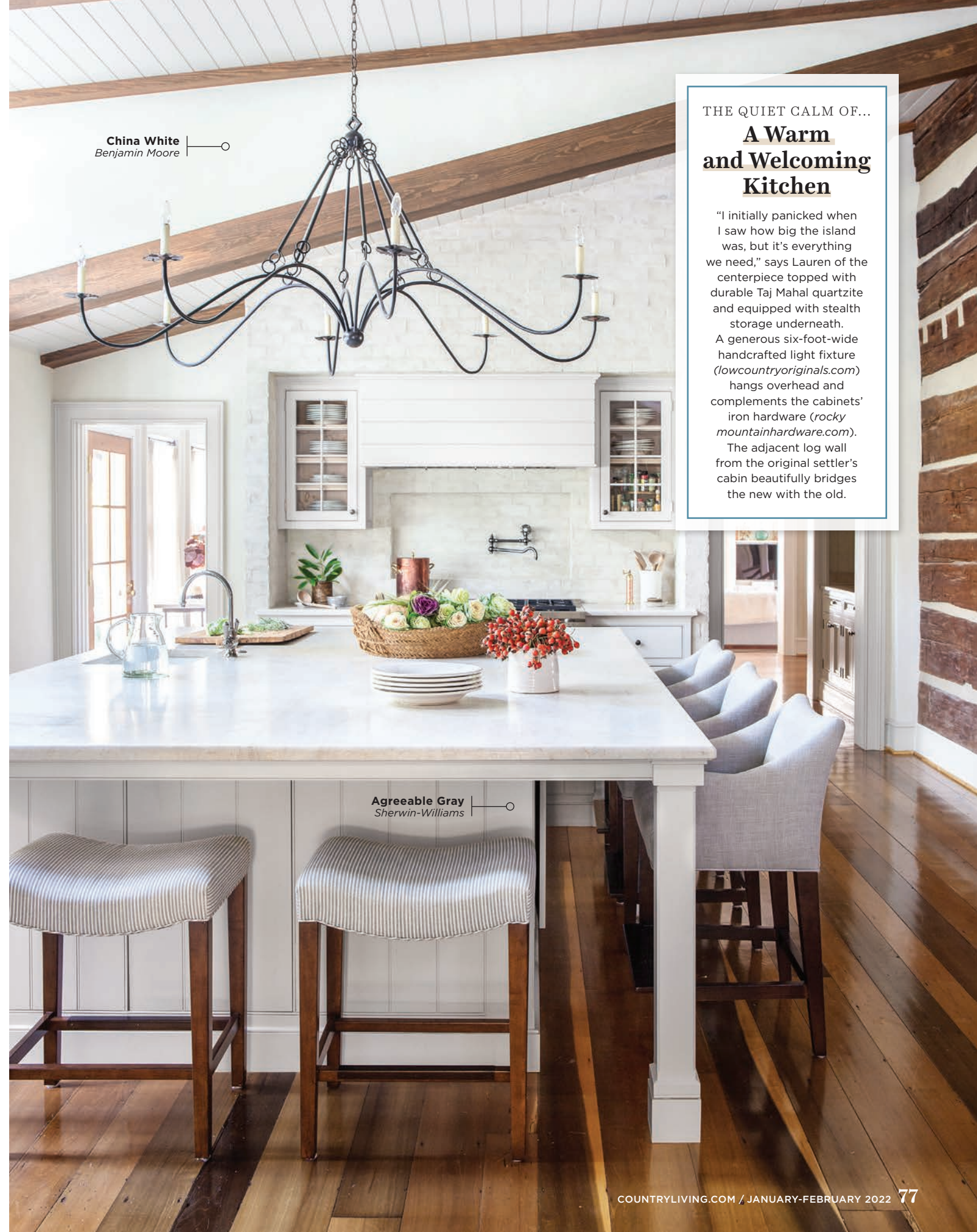
China White Benjamin Moore

Appraiser Marsha Dixey says this piece is in the style of Victorian Black Forest furniture. In Europe, the intricate carvings, typically depicting animals or vegetation, were a symbol of wealth. These days, the largest, most intricate mirrors (not shown) can be valued for up to $7,000.