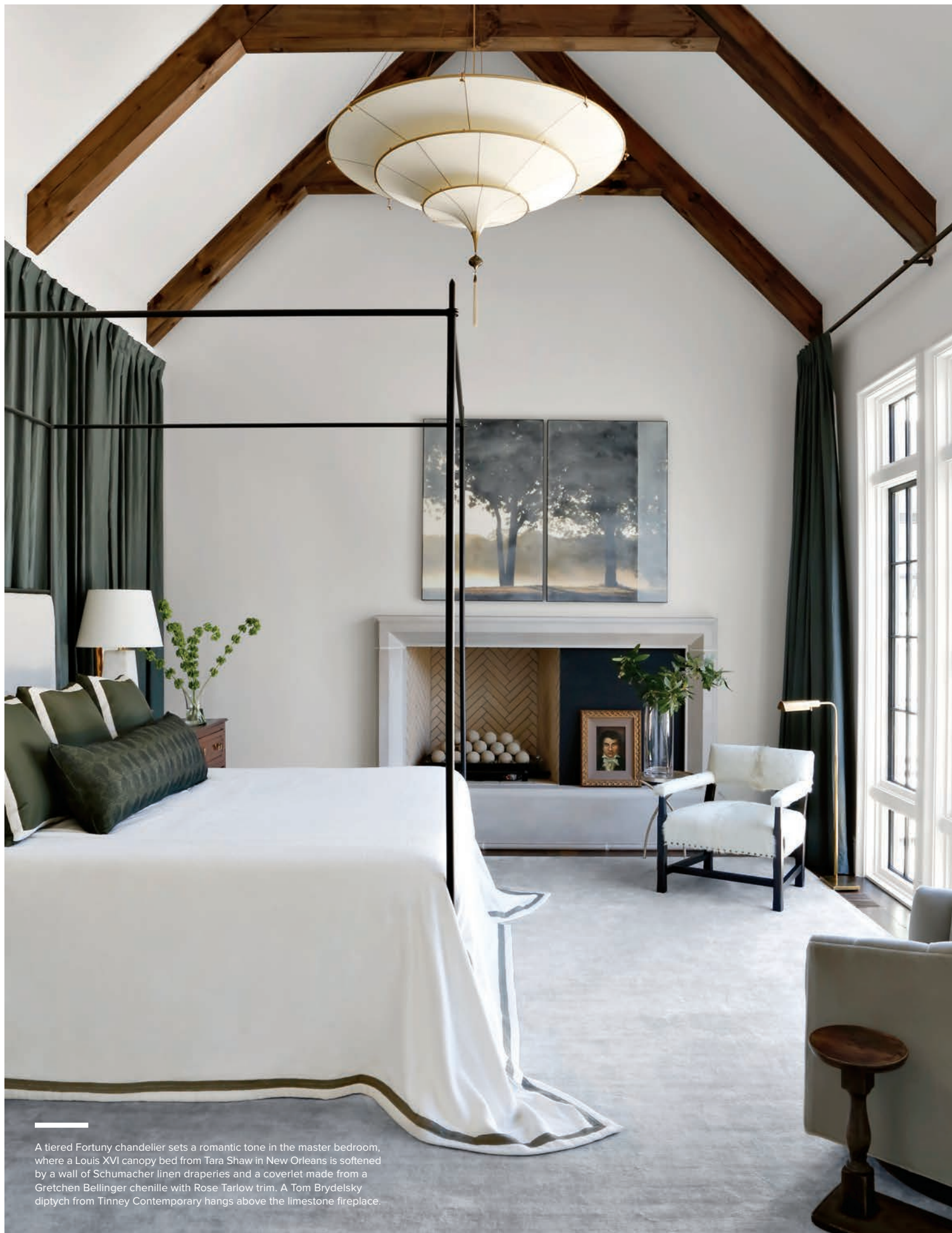
A tiered Fortuny chandelier sets a romantic tone in the master bedroom, where a Louis XVI canopy bed from Tara Shaw in New Orleans is softened by a wall of Schumacher linen draperies and a coverlet made from a Gretchen Bellinger chenille with Rose Tarlow trim. A Tom Brydelsky diptych from Tinney Contemporary hangs above the limestone fireplace.