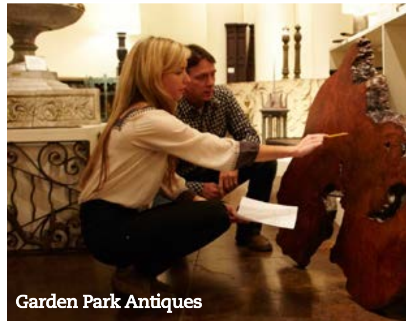
Garden Park Antiques