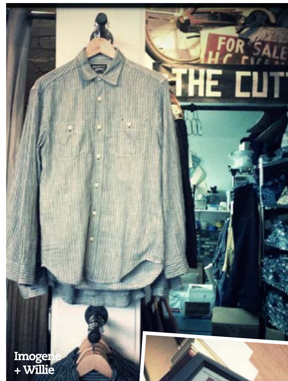
Imogene + Willie