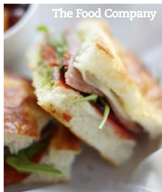
The Food Company

If you want something good for your soul, go to a concert at Ryman Auditorium. This former tabernacle was the original home of the Grand Ole Opry and welcomes everyone from country singers to bluegrass bands. Countless legends—including Hank Williams, Johnny Cash, and Emmylou Harris—have graced its stage. It's hands-down the best venue to hear live music. (116 5th Avenue N, www.ryman.com )