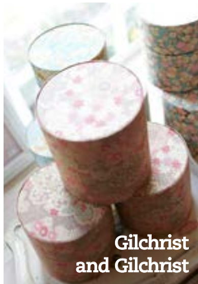
Gilchrist and Gilchrist

I love mixing antique architectural pieces—salvaged doors, windows, and mantels—into my projects, so I often find myself rummaging through the Preservation Station's rusty hardware and cast-iron sinks. It's one of those stores that really stretches your creativity—helping you to find beauty in unexpected places. (1809 8th Avenue S, www.thepreservationstation.com )