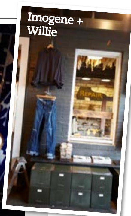
Imogene + Willie