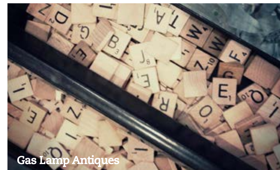
Gas Lamp Antiques