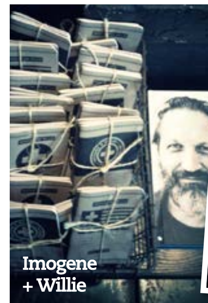
Imogene + Willie